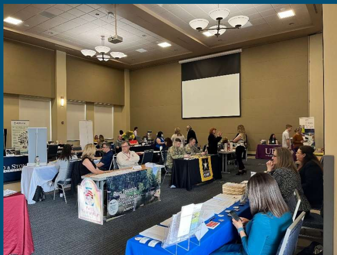
The North Hills Community Job Fair at the RLA Learning and Conference Center was a great success with around 50 job seekers meeting with the 40 different businesses that attended.