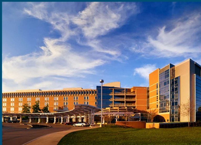
UPMC Passavant (above) is one of the many health care facilities throughout the state to receive funding from the bipartisan funding bill, House Bill 253.

On January 26 th , Governor Wolf signed House Bill 253 into law, providing $250 million in funding to assist health care systems during the COVID-19 pandemic. Of this approved funding to support health care facilities throughout the state, $1.5 million will be coming to our district. The local health care facilities that will be receiving funding are as follows: UPMC Passavant: $1.1 million, Allegheny Health Network (AHN) Wexford: $455,516 and AHN McCandless Neighborhood Hospital: $28,470.